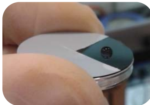
Fig. 1 De-wrinkled graphene sample collection prior to drying

to room temperature. Sample V was produced with 1 g of PVA and in the same manner like sample IV.