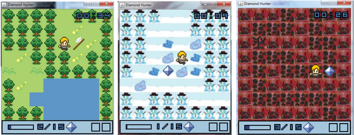
Fig. 1 Diamond Hunter Themes