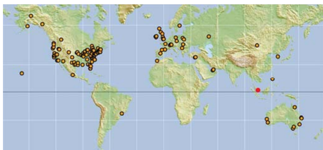
Fig. 2 AR Sandboxes around the world and Singapore (in red).

AR Sandboxes has been developed and used and their numbers have exceeded 150 globally (Fig. 2). The most recent one was built in Singapore, at the Department of Geography, National University of Singapore (NUS) to support modern approach to geoscience education.