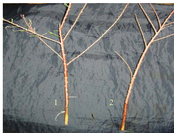
Fig. 3 Effect of a biostimulator on rooting of shanks Tamarix gracilis . 1 - an experimental plant processed by a solution of a biostimulator (50 ng/ml). 2 - the control plants. Time of an exposition – 1 month

We investigated applicability of our biostimulator as a hormone for acceleration of vegetative reproduction of perennial plants. For this purpose we have taken shanks of desert plant Tamarix gracilis have left on 12h soaked in a solution of a biostimulator of concentration 50 ng/ml. After that shanks have taken out and have lowered them in drink water. Water was changed each 4-5 days and experiment was carried out within 1 month and observed formation of roots and leaves at shanks. Results of experiments are given in Fig. 3.