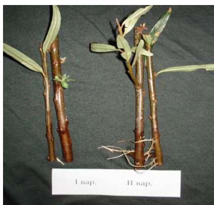
1 2 a

Experiments on rooting were carried out with Tamarix gracilis too. Results are presented in Figs. 4 and 5. It is necessary to note that the biostimulator causes formation of roots and also the formation of leaves. The given fact is distinctive feature of our new biostimulator. All other phytohormones have polarity of action. For example, auxine stimulates formation of only lateral roots and stops growth of leaves. Cytokinin stimulates growth of leaves, and growth of roots is not observed.