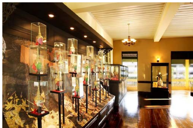
Fig. 5 Thai mask exhibition in the learning center

The center needs to develop products to match the needs and wants of the target customer groups in order to attract more customers and fulfill the objective of the center in cultural promotion and education. For instance, the center should change the theme of the permanent exhibition to the history of the mansion, portraying the lives of the princess and court ladies. Moreover, the center should host more temporary exhibitions and the theme should be in accordance with social trends and the interests of the target groups to attract both new and old visitors. Both types of exhibitions should be interactive, encouraging visitor participation.