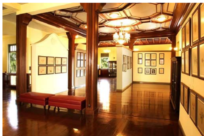
Fig. 3 The painting exhibition in the learning center [5]

This research's main conceptual framework was adapted from the concept of marketing management, by Philip Kotler [4]. It is also useful in analyzing marketing management process and identifying gaps. The marketing management consists of 5 stages.