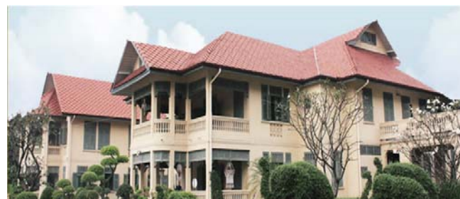
Fig. 1 The main learning center [3]

Princess Saisavali Biromya, Princess Suthasininart Piyamaharaj Padivaradda, a consort of King Chulalongkorn of Siam. The office has three smaller learning centers which are not included in the research due to recent development. Despite its long history and good administration, the center is not well-known. In order to develop the center, marketing should be applied to its management.