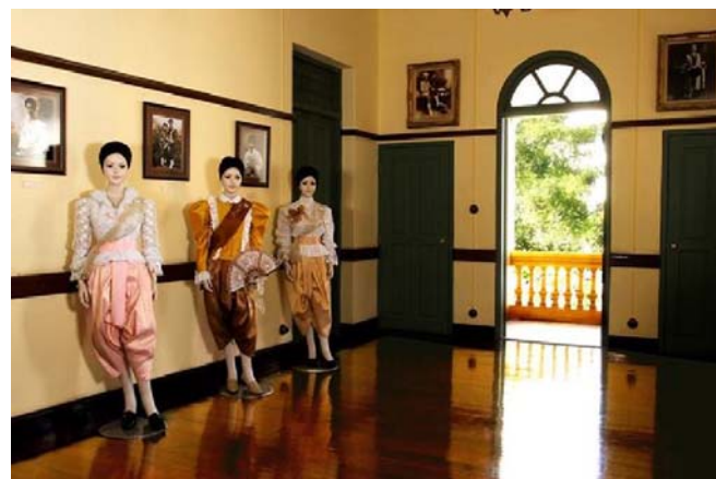
Fig. 4 The costume exhibition in the learning center

The managers and planners need to thoroughly analyze the situation by using SWOT analysis. Internal and external factors must be included. However, negative factors should not be the main focuses.