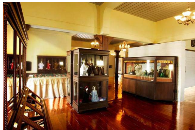
Fig. 6 Thai puppet exhibition in the learning center

The evaluation process consists of planning, data collection and evaluation. During planning, the managers and planners need to identify the target, the indicators and milestones, data collecting methods and evaluation period for evaluating marketing activities. However, to identify what data to collect, the planners need to consider the limits of time and resources.